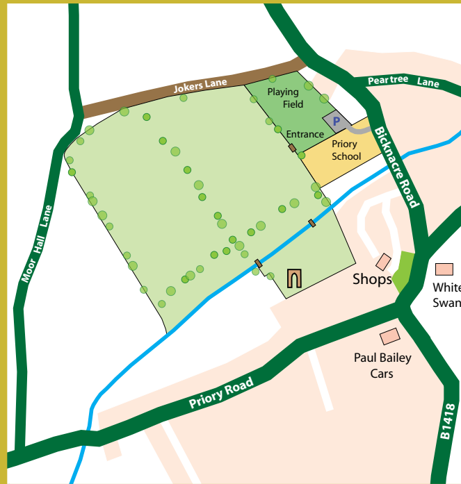
Location of Priory Fields